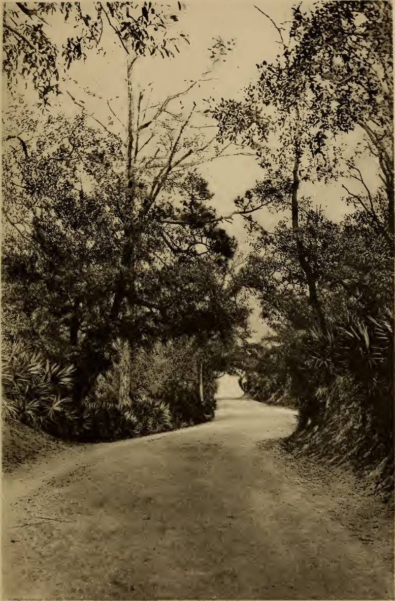
SHELL ROAD AT BEACH